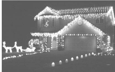
Representative picture of all winners